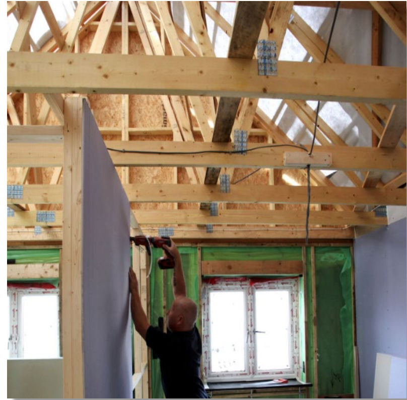
Space4 Persimmon Homes