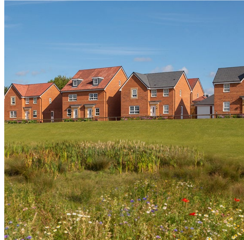
Wigston Meadow, Leicester